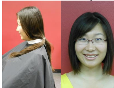
Before: After: By Melissa