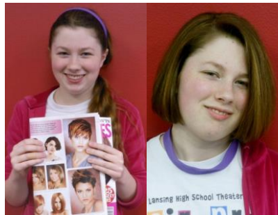
Before After: By David