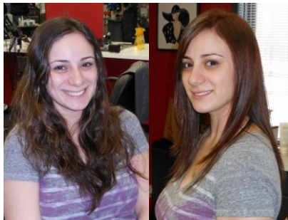
Before: After: By Fadia

We all know that a haircut can make a huge difference in the way we look, not to mention the way we feel. Check out these before and after photos of some of our clients to get your own inspiration!